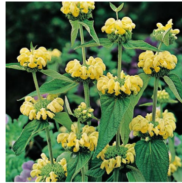
(bird nest amid the Phlomis & Phlomis when in flower)

When you walk through the garden, know that the seed heads following the flowers provide food, the pond and raingarden provide water, and the foliage provides the cover for their safety, as they nest or forage for seeds and insects. The varied scope of the three gardens, the Fern Display Garden, the Haiku Garden, and the Mixed Borden weave a tapestry of life and beauty. They also give us all a place of peace- if only for a few moments.